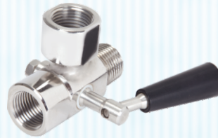
3 Way Gauge Cock