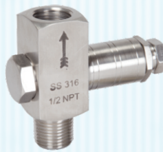
2 Way Gauge Cock