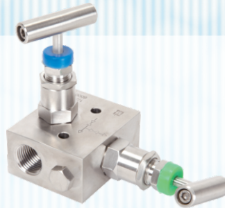
2 Way Manifold