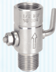
2 Way Gauge Cock